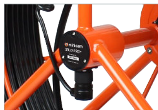
Integrated Meterage Counter