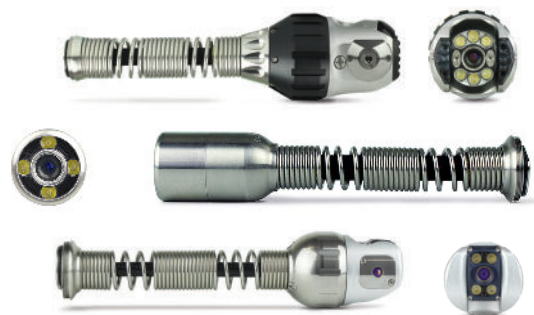
Top: Pan Rotate Laser Camera CAM026L. Centre: Axial Camera CAM025 Bottom: Pan Rotate Laser Camera CAM050. Push camera system also available with Pan Rotate Camera CAM026

Push camera systems are available with an axial camera, or choice of two pan rotate laser cameras or as a duo system with two cameras. Built for longevity, with excellent optical qualities, the cameras are rugged, with robust connectors.