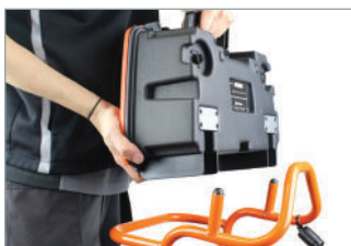
Easy-fit Control Unit