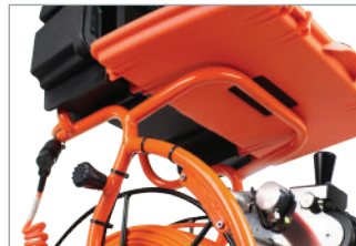
Easy Fit Control Unit