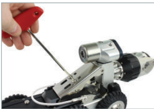
Quick Release Lift