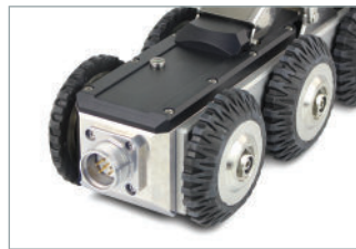
Heavy Duty Rear Connector