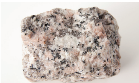
GeoSpray mortar has the chemical structure like a natural stone, giving it benefits that traditional cement materials cannot deliver

One can think of GeoSpray mortar as an advanced cement. Compressive, tensile and flexural properties of GeoSpray mortar have been engineered to meet or exceed those you would expect from a standard cement formulation.