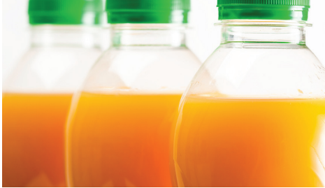
GeoSpray is a geopolymer – but not a Plastic