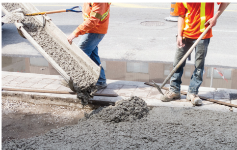
GeoSpray mortar has the look and feel of standard cement mortars when it is being processed and applied

When you see the term geopolymer for the first time, many people immediately assume the material will be a plastic like HDPE or Polyester. While it is true plastics are polymers, not all polymers are plastics. So, instead of thinking of the materials you find in plastic bottles or food storage containers you should picture a material that behaves like cement.