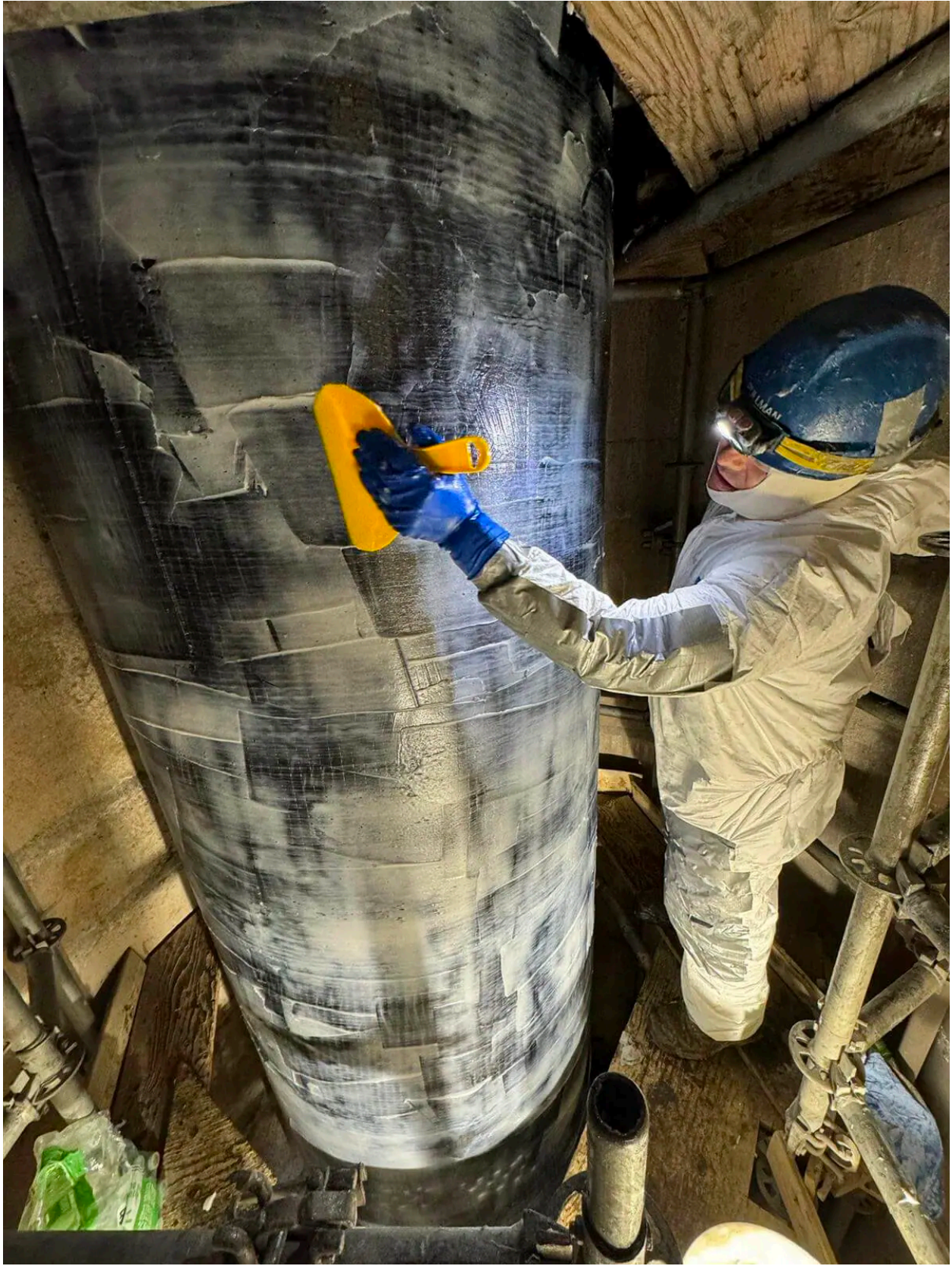
Installation of StrongPIPE® V-Wrap™ System