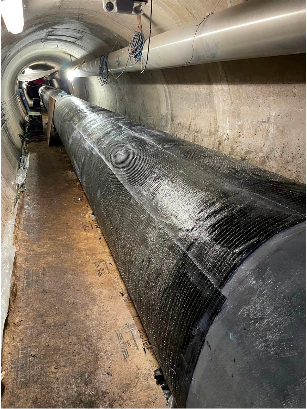
Completed restoration on horizontal pipe