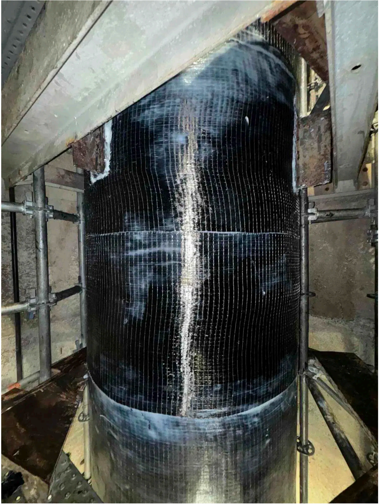
Completed restoration on vertical pipe