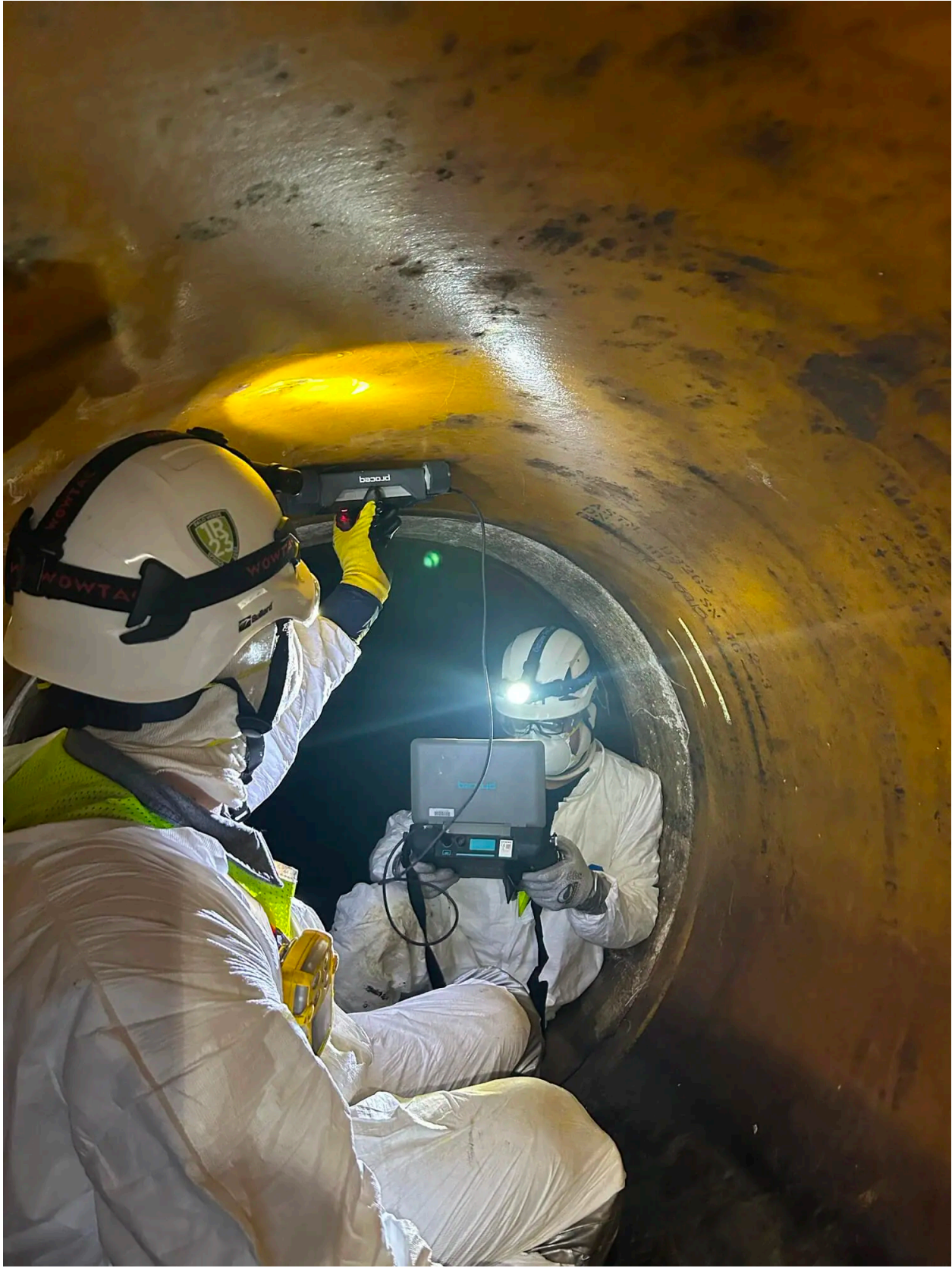
Inspection of pipeline