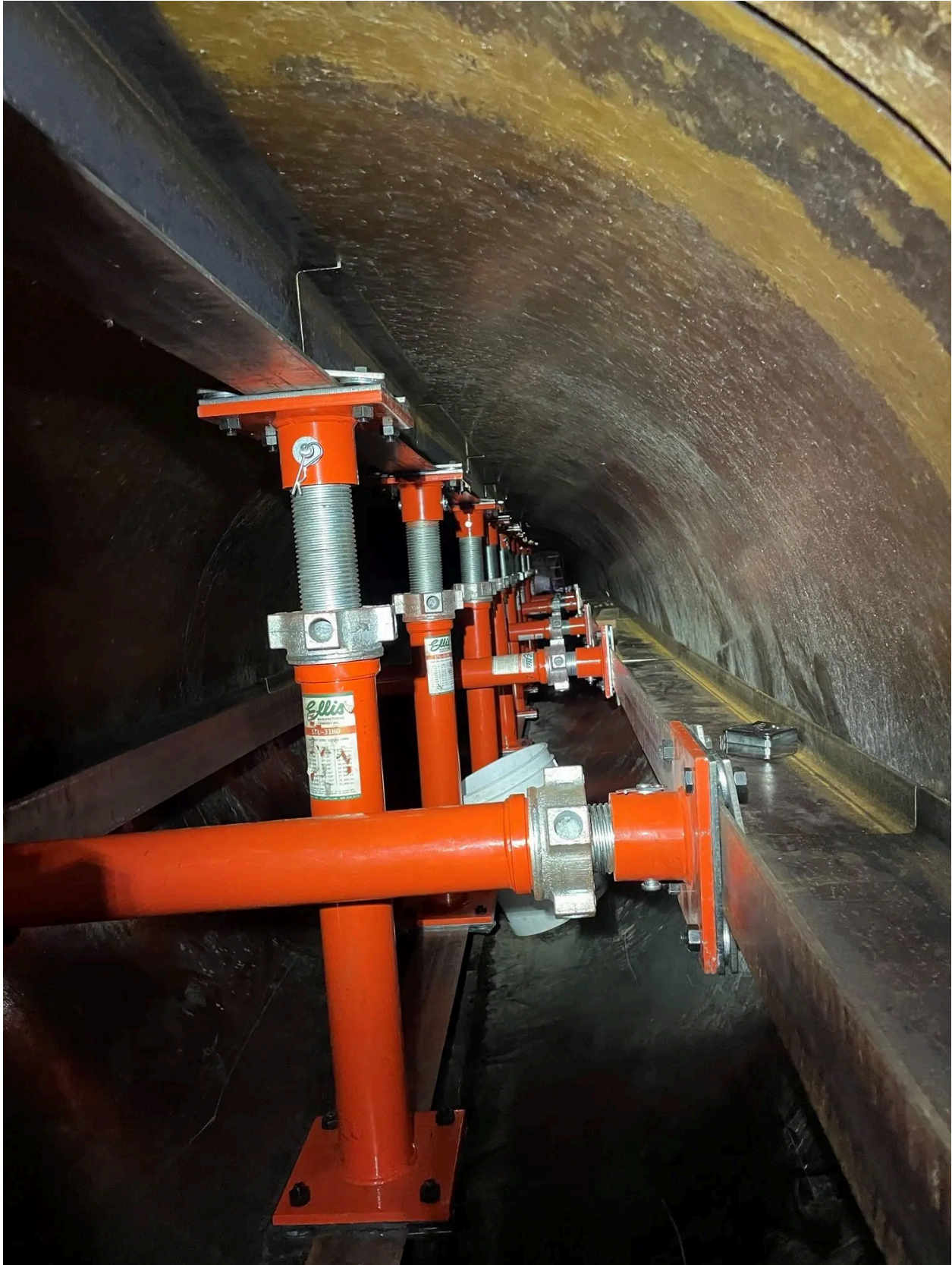
Shoring system to ensure safe entry