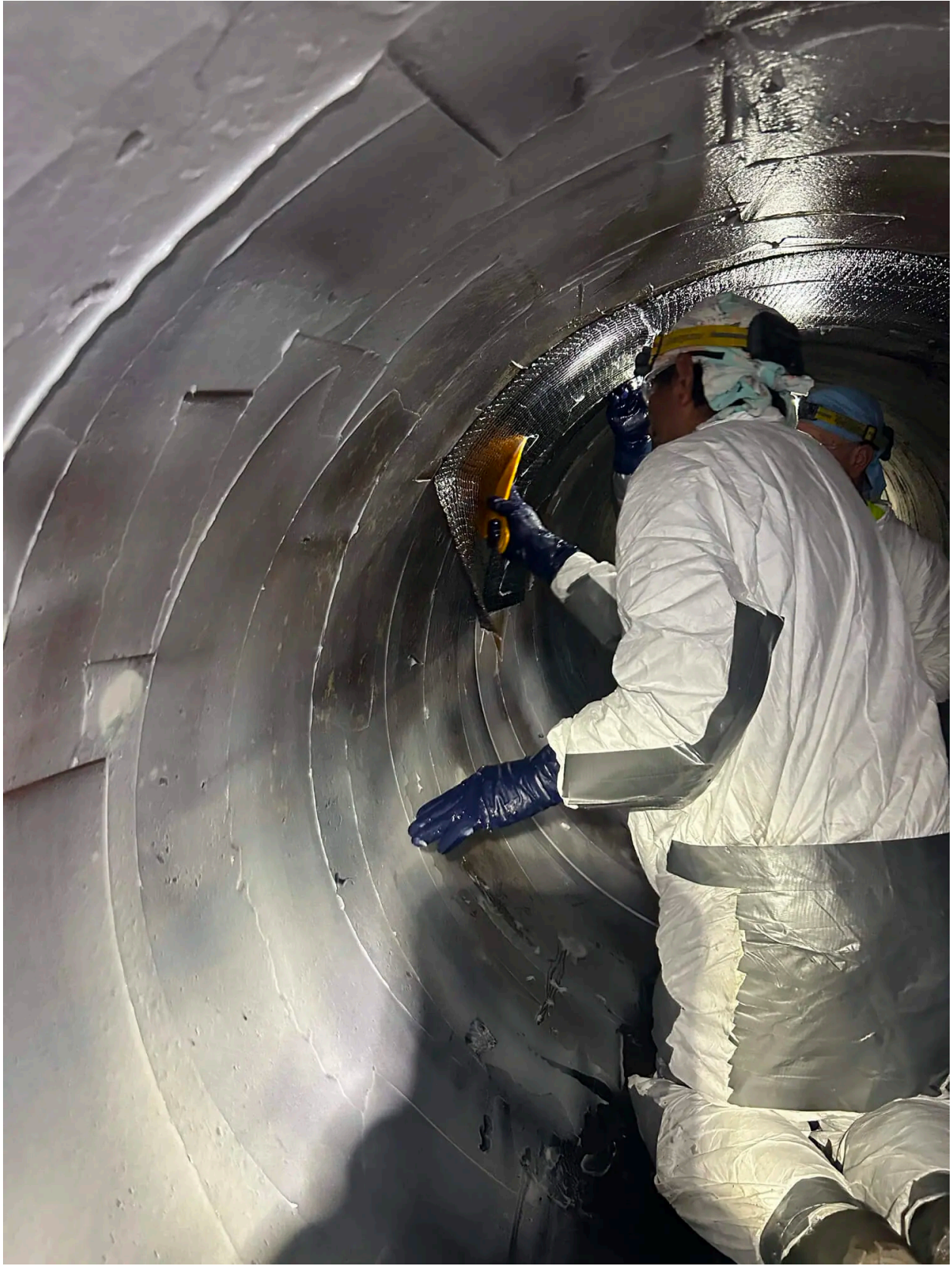
Installation of StrongPIPE® VWrap™ Carbon Fiber system