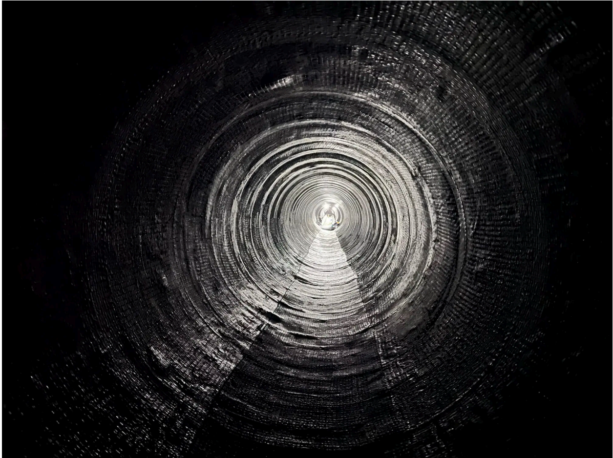
Completed restoration of critical sewer line