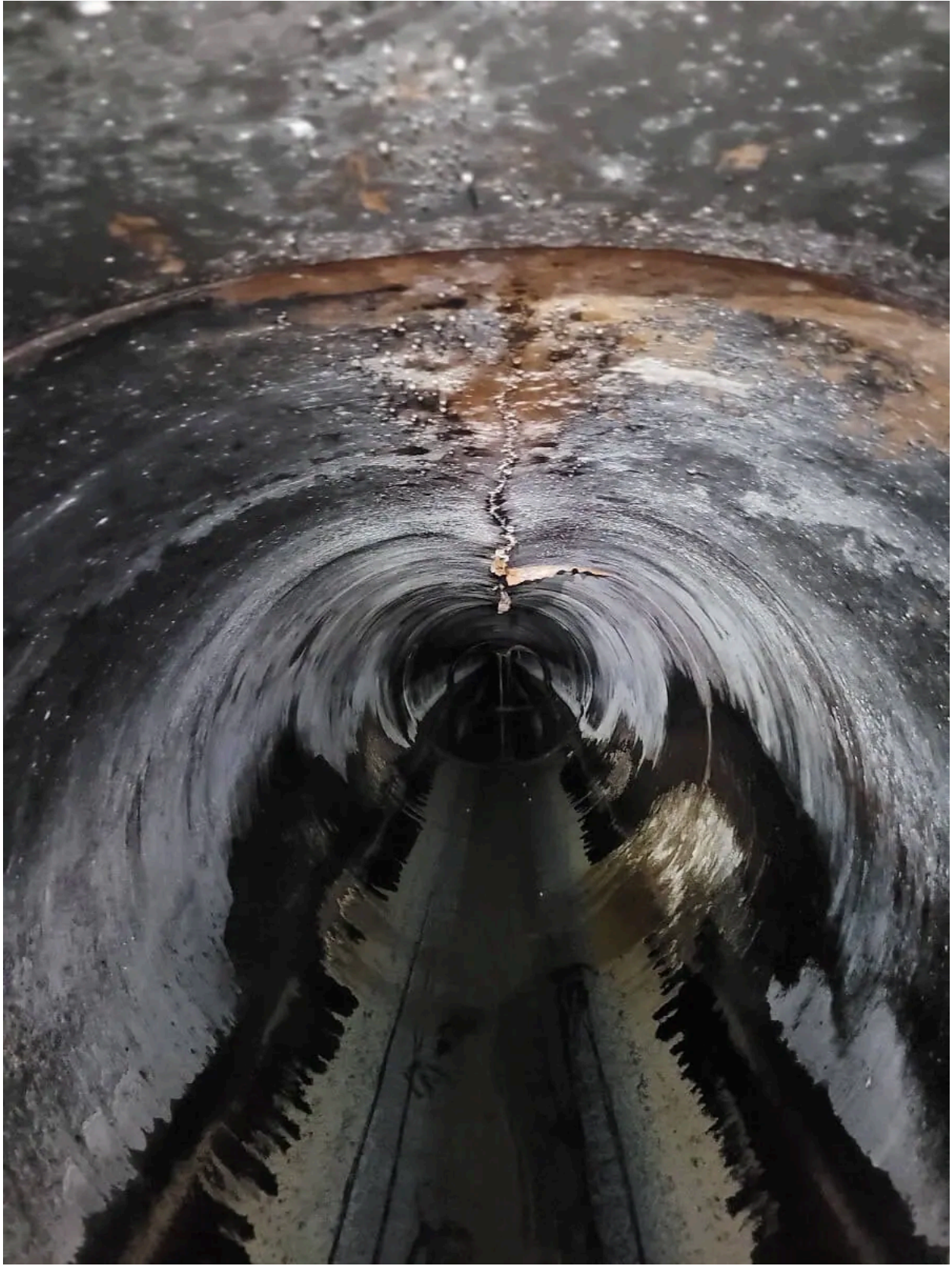
Pipeline before restoration