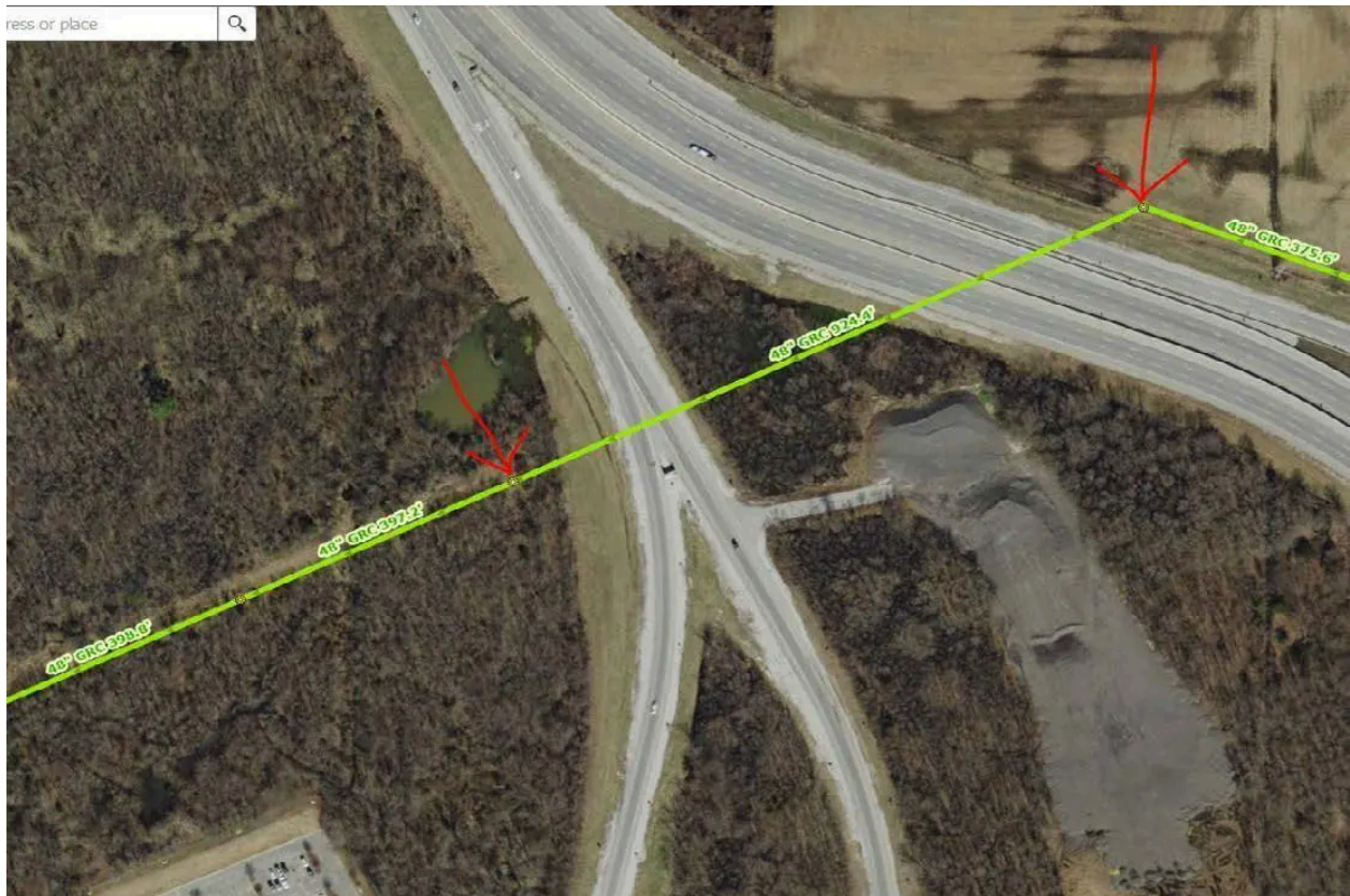
Location of sewer line beneath highway