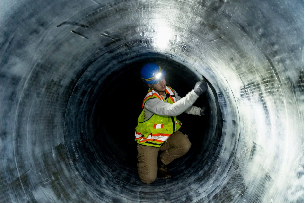
Topcoat installed for protection scaled